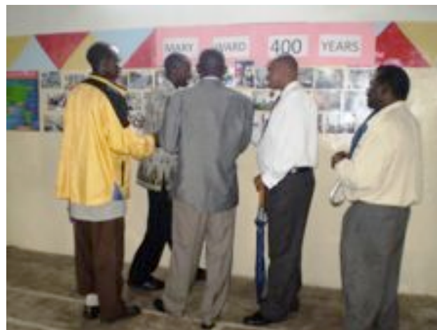
Photo right: Several of the community elders who attended the celebration

This was a celebration for youth and adults. Later in the year we are going to have a picture colouring competition for the very many young children in our Parish so that they too can join with us in celebrating 400 years of the Institute.