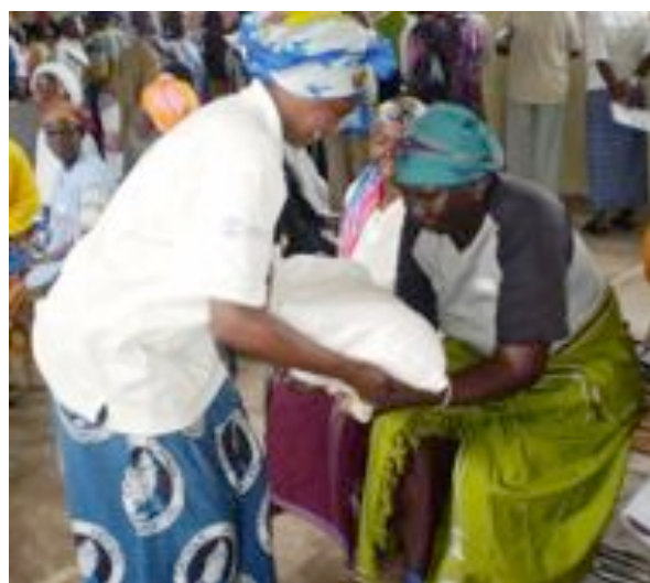
Photo left: Prize 1: A leper patient receiving her prize of a 10 kg sack of mealie meal